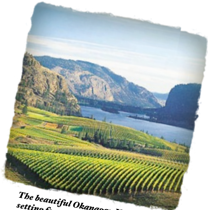
The beautiful Okanagan Valley is the setting for a three-day, back-roads tour.

Come one, come all! The Okanagan Classic Thunderbird Club will present its 17th annual show and shine, followed by a three-day tour through the British Columbia countryside. This event draws T-Bird enthusiasts from as far away as Arizona and Minnesota. In 2008, 80 T-Birds from 1955-2005 participated in the show and 54 enjoyed the three-day tour. Make this the year that you attend!